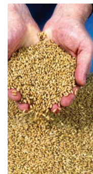
A Grain of Wheat!

Times: Fridays at 9:30 am, Saturdays 4:00 pm Sundays 7 am and 2:30 pm. On demand: www.slmedia.org/yeslord